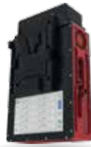
WMT LIVE LINK H.265